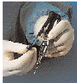
Detachable telescoping handswitch

The TPS U 2 Drill represents the latest generation of Stryker Instruments high-speed, micro-powered instrumentation. The advanced design of this 75,000 rpm handpiece provides the surgeon with efficiency and control for all bone dissecting procedures. No lubrication or tooling is required for the motor, attachments, or cutting accessories. Providing innumerable handpiece combinations, the power and versatility of this drill sets the standard for high-speed surgical instrumentation.