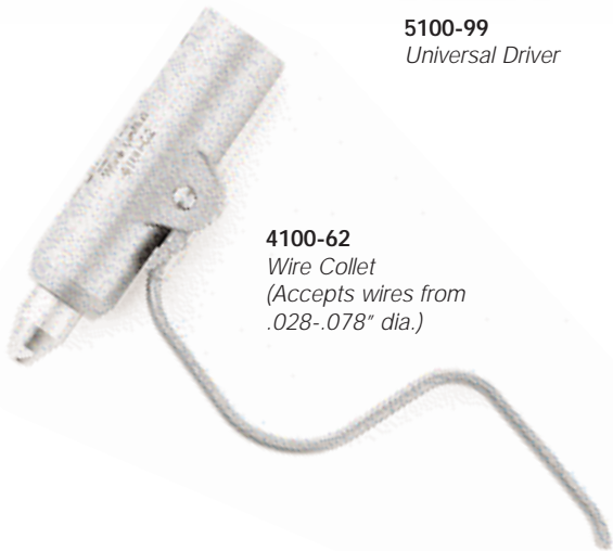
4100-62 Wire Collet (Accepts wires from .028-.078" dia.)