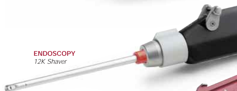
ENDOSCOPY 12K Shaver