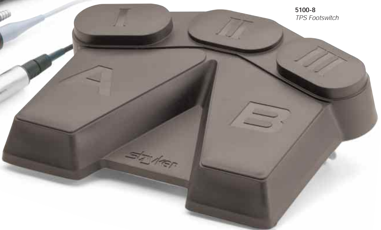
5100-8 TPS Footswitch