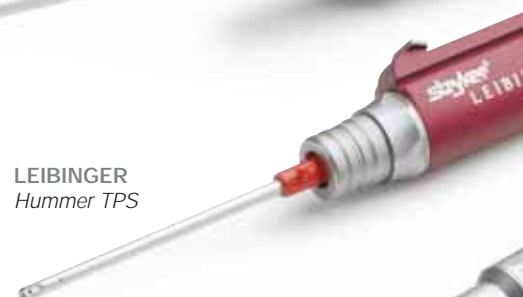
LEIBINGER Hummer TPS