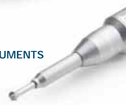
INSTRUMENTS U 2 Drill