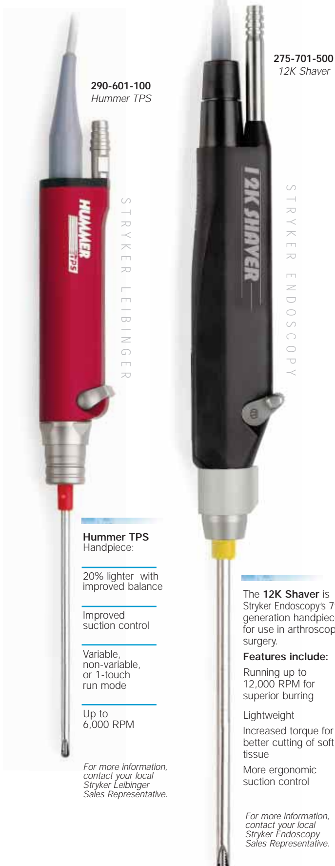
290-601-100 Hummer TPS