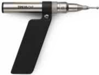
5100-10-110 Universal Drill Handle

*Multiple sterilization cases are available in both plastic and stainless steel.