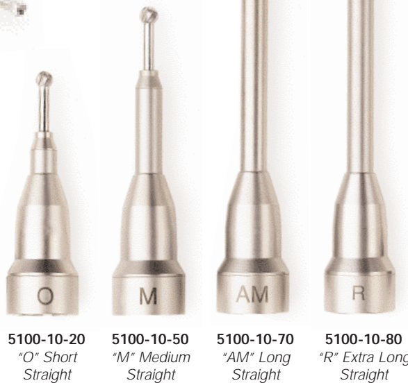
5100-10-20 "O" Short Straight