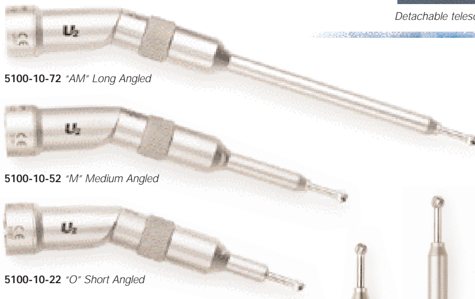
5100-10-72 "AM" Long Angled