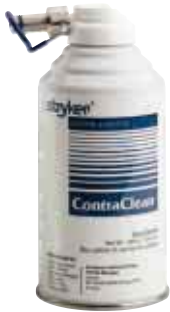
260-901-739 Contra-Clean™ (MicroDrill attachments)