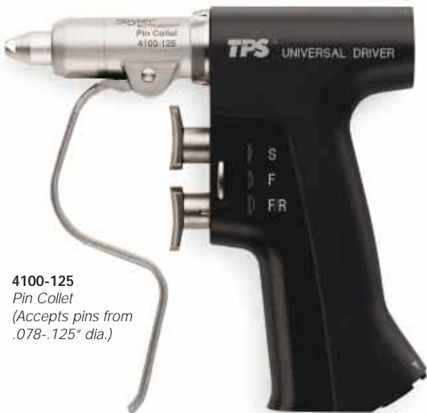
4100-125 Pin Collet (Accepts pins from .078-.125" dia.)