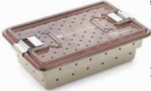
5100-177 TPS Handpiece Sterilization Case

The Stryker Total Performance System offers a variety of accessories to complete and compliment your surgical needs.