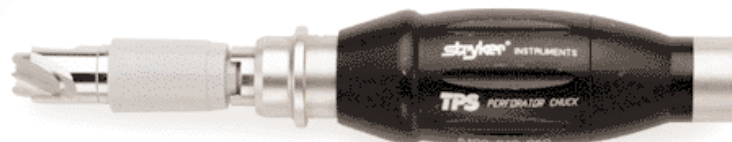
5100-10-60 Perforator Chuck