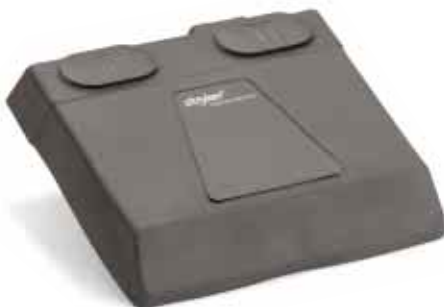
5100-7 TPS Uni-Directional Footswitch