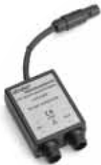
5100-8-200 TPS Dual Footswitch Adapter