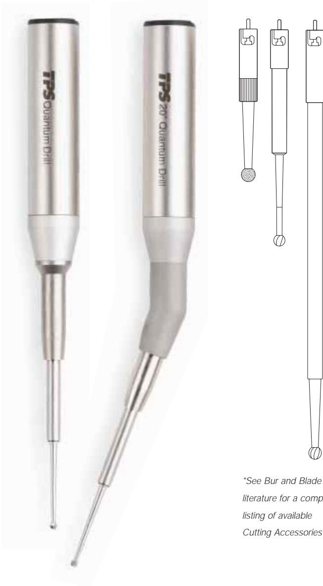
Short, Medium and Long Burs*

*See Bur and Blade literature for a complete listing of available Cutting Accessories