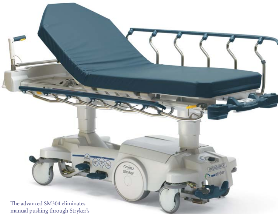
The advanced SM304 eliminates manual pushing through Stryker's Zoom® motorized technology.

Optional integrated scale system provides accurate, repeatable weights