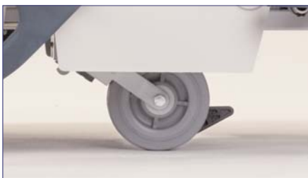
The SM104 uses a retractable fifth wheel to provide superior maneuverability and cornering.

Fully-equipped and completely adaptable, the M-Series allows you to choose the mobility solution that best suits your needs. Supremely mobile and user-friendly, these stretchers greatly reduce the physical strain on clinicians without sacrificing patient care and comfort.