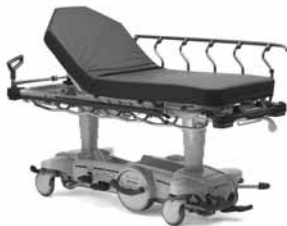
SM204 with Big Wheel