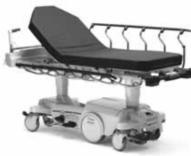
SM304 with Zoom Drive