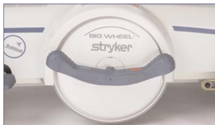
The SM204's Big Wheel® reduces start-up force by 50% and steering effort by 60%.