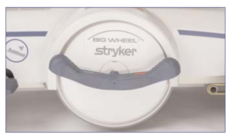
The SM204's Big Wheel® reduces start-up force by 50% and steering effort by 60%.