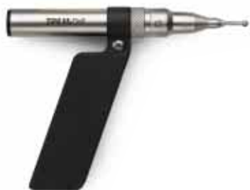
5100-10-110 Universal Drill Handle

*Multiple sterilization cases are available in both plastic and stainless steel.