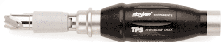
5100-10-60 Perforator Chuck