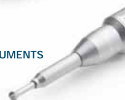
INSTRUMENTS U 2 Drill