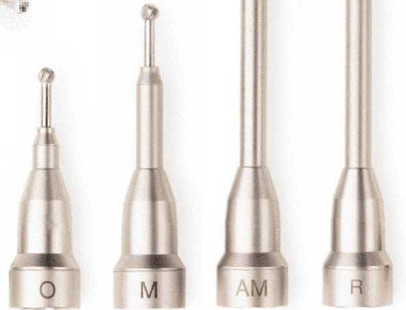
5100-10-20 "O" Short Straight