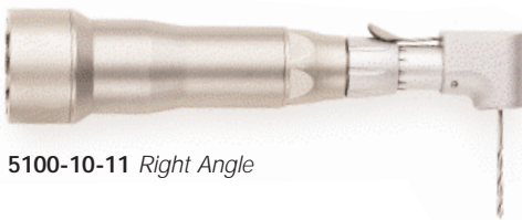
5100-10-11 Right Angle