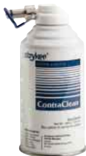
260-901-739 Contra-Clean™ (MicroDrill attachments)