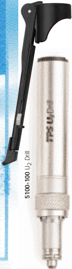
5100-100 U 2 Drill

The TPS U 2 Drill represents the latest generation of Stryker Instruments high-speed, micro-powered instrumentation. The advanced design of this 75,000 rpm handpiece provides the surgeon with efficiency and control for all bone dissecting procedures. No lubrication or tooling is required for the motor, attachments, or cutting accessories. Providing innumerable handpiece combinations, the power and versatility of this drill sets the standard for high-speed surgical instrumentation.