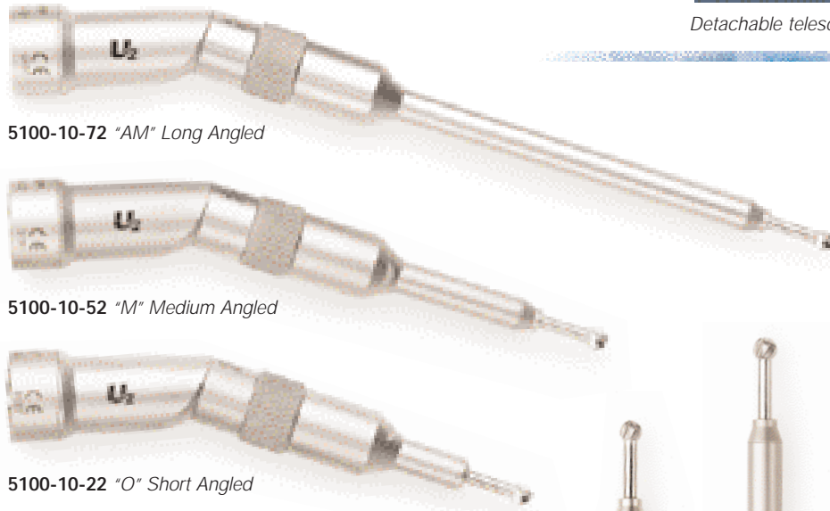
5100-10-72 "AM" Long Angled