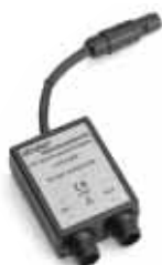
5100-8-200 TPS Dual Footswitch Adapter