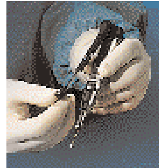
Detachable telescoping handswitch

The TPS U 2 Drill represents the latest generation of Stryker Instruments high-speed, micro-powered instrumentation. The advanced design of this 75,000 rpm handpiece provides the surgeon with efficiency and control for all bone dissecting procedures. No lubrication or tooling is required for the motor, attachments, or cutting accessories. Providing innumerable handpiece combinations, the power and versatility of this drill sets the standard for high-speed surgical instrumentation.