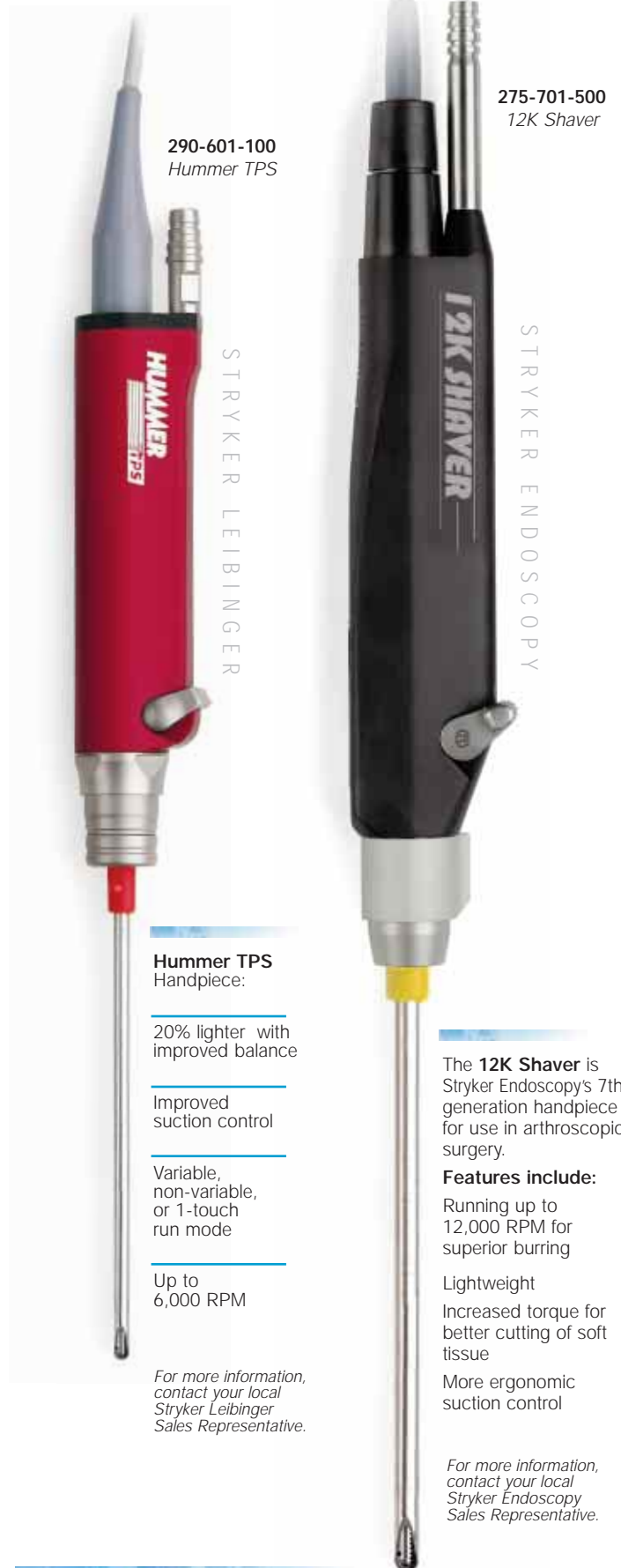
290-601-100 Hummer TPS