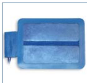
REM Polyhese™ II Patient Return Electrode