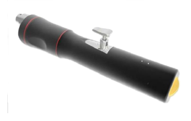
Fig.7 Lock the end cover

Step 3: Align the two points between the main unit and the end cover, then turn the knob clockwise to lock.