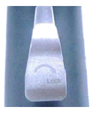
Fig.8 Mark on the switch

Turn the switch 90 degrees counter-clockwise (as in Figure 8 below). The saw will now run when the switch is pressed. The actual speed is controlled by how far the switch is depressed. Gentle pressure means low speed, and firmer pressure will result in higher speed.