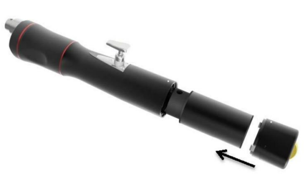
Fig.2 Insert the battery

Step 2: Put the battery into the main unit.