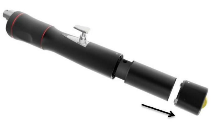
Fig.6 Remove the battery