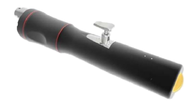
Fig.4 Lock the end cover

Disassembly: Step 1: Rotate the knob counter-clockwise to unlock and remove the end cover.