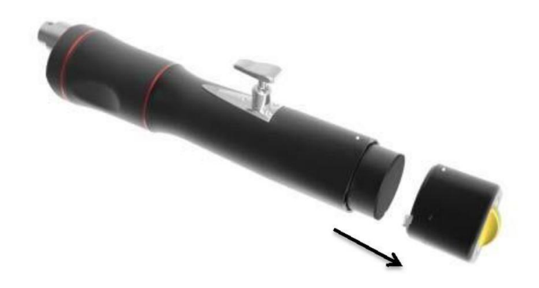
Fig.5 Take off the end cover

Disassembly: Step 1: Rotate the knob counter-clockwise to unlock and remove the end cover.